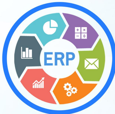
ENTERPRISE RESOURCE PLANNING